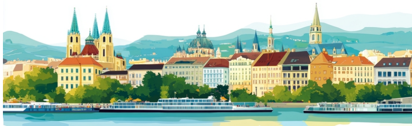
View of Vienna, Austria from the River Danube